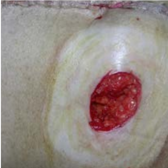
A. Immediate postoperative, right lower quadrant wound

An 83-year-old male presented with an open postoperative contaminated wound at a previous ileostomy site. V.A.C. VeraFlo™ Therapy was initiated using V.A.C. VeraFlo™ Dressing. Microcyn® (Oculus Innovative Sciences, Petaluma, CA) was instilled until the foam was filled followed by a soak time of 10 minutes. Instillation was repeated every 4 hours followed with continuous negative pressure at -125 mmHg for 12 days. Therapy was discontinued when patient transitioned out of the acute care setting and the wound could be treated with local wound care alone. No complications occurred during therapy.