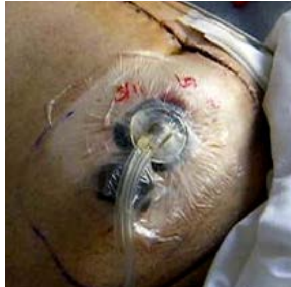
B. Application of V.A.C. VeraFlo™ Therapy with instillation of Microcyn®