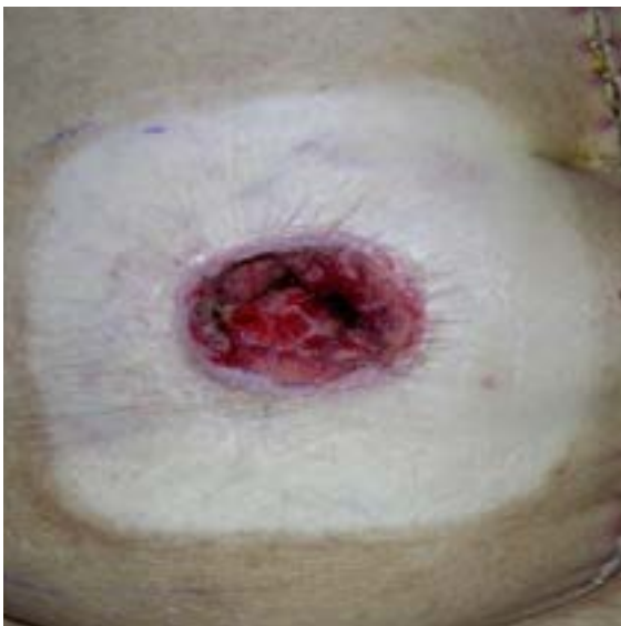
C. Day 10 of V.A.C. VeraFlo™ Therapy at 4th dressing change