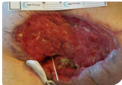
Fig. E: Postoperative Day 27. Wound appearance after 7 days of V.A.C. VERAFLOR™ Therapy.