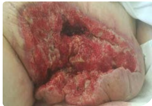
Fig. D: Postoperative Day 24. V.A.C. VERAFLOR™ Therapy was continued with 80ml of normal saline with 5-minute dwell time, followed by continuous negative pressure at -125mmHg every 4 hours.

On postoperative Day 27, after 7 days of treatment, the wound volume was reduced to 23cm x 14cm x 9.5cm, and the patient was discharged to a rehabilitation facility (Fig. E). V.A.C.® Therapy (KCI, an Acelyty Company, San Antonio, TX) was initiated with continuous negative pressure at -125mmHg for 3 weeks. On postoperative Day 48, the patient underwent a split-thickness skin graft (STSG) for wound closure. V.A.C.® Therapy was used to bolster the STSG for 1 week, and the patient was discharged home from the rehabilitation facility with a healed wound (Fig. F).