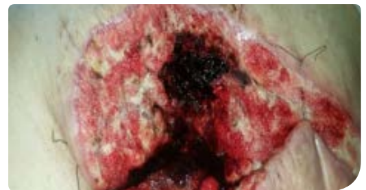
Fig. C: Postoperative Day 21. Wound appearance before initiation of V.A.C. VERAFLOR™ Therapy (100mL of 0.25% acetic acid instilled with 5 minute dwell time, followed by continuous negative pressure at -125\text{mmHg} every 6 hours).