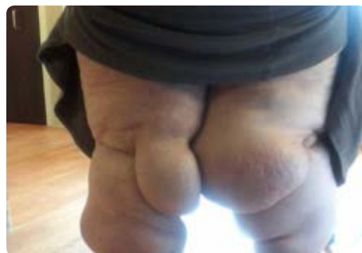
Fig. F: Postoperative Day 56. Healed wound following STSG.

Patient data and photos courtesy of Elizabeth McElroy, CRNP, CWS, CWOCN; West Reading, PA