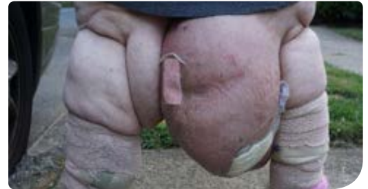
Fig. A: Pre-operative picture of patient with MLL of right thigh.

After 11 days of twice daily gauze packing, there was no reduction in wound size and little improvement in pain, odor, or wound tissue type ( Fig. B ). On postoperative Day 21, retention sutures were removed, revealing a large hematoma with the wound measuring 34.5cm x 15cm x 14.5cm ( Fig. C ). V.A.C. VERAFLOR™ Therapy (KCI, an Acelyty Company, San Antonio, TX) was initiated using the V.A.C. VERAFLOR™ Dressing (KCI, an Acelyty company, San Antonio, TX); 100ml of 0.25% acetic acid was instilled with a 5-minute dwell time, followed by continuous negative pressure at -125\text{mmHg} every 6 hours.