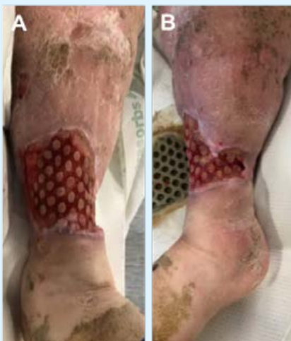
Fig. 1: Venous leg ulcer at presentation. A. Anterior view; B. medial view.

V.A.C. VERAFLOR™ Therapy using V.A.C. VERAFLOR CLEANSE CHOICE™ Dressings were used as wound required cleansing to help remove infectious materials. Ostomy barrier paste was utilized to assist with the creation of dressing seals. The wound was instilled with 34mL of quarter strength Dakin's solution with a 10-minute dwell time , followed by 1 hour of continuous negative pressure (-125mmHg) . After 24 hours, the dressing was changed, and the instillation solution was switched to 28mL of normal saline ( Figure 2 ). Dressing changes occurred every 2-3 days.